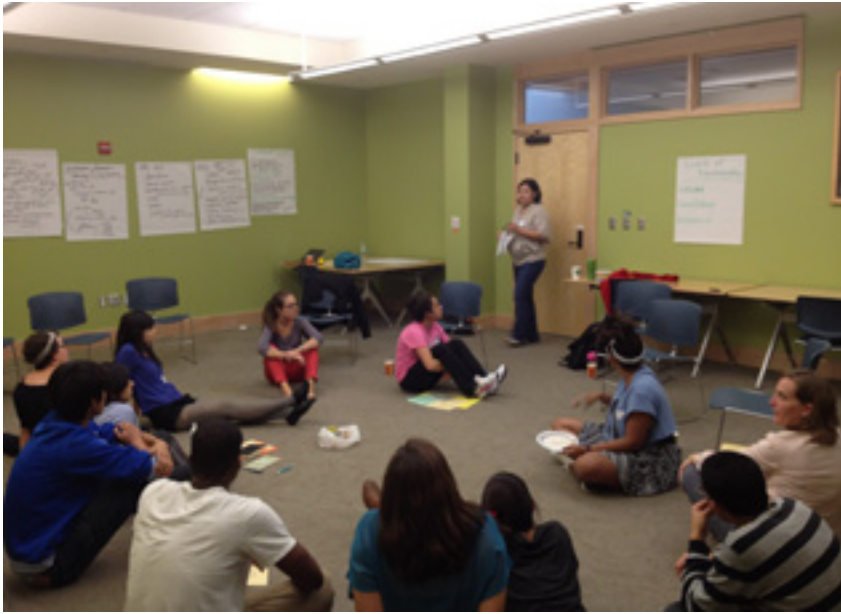
DPP participants engage in a presentation this Saturday, October 20th